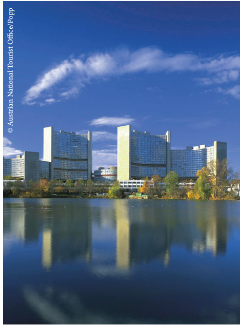
United Nations headquarters in Vienna