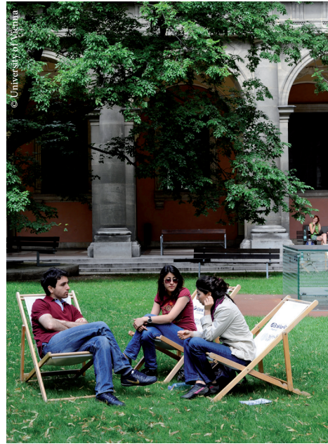
Students in the courtyard of the University of Vienna